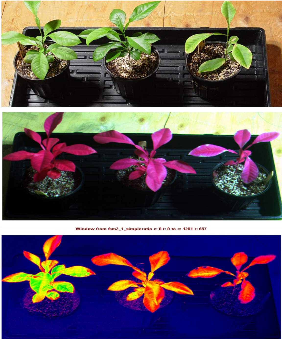
Fig. 2. Foliage of citrus plants exhibiting various levels of foliar damage caused by false spider mites ( Brevipalpus spp.), photographed in conventional color (upper), color infrared (middle), and transformed to simple ratios of near-infrared to red reflectance (lower). Damage levels within each frame ranged from slight (left), to moderate (middle) and heavy (right). (Modified from Summy et al. 2005).