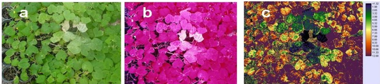
Fig. 4. Spider mite feeding damage was evident in all types of imagery acquired on 30 September 2005. CC imagery (a) suggested that mite feeding damage (characterized by light green or white foliage) was largely concentrated within the central portion of the planting, whereas CIR imagery (b) suggested a much greater extent of foliar damage (characterized by whitish and pinkish coloration). A similar interpretation was provided by ratio imagery (c), which indicated relatively low NIR/R ratios (characterized by bluish and greenish coloration) within the central portion of the planting and relatively high ratios (characterized by orange and purple) in the remainder of the planting.