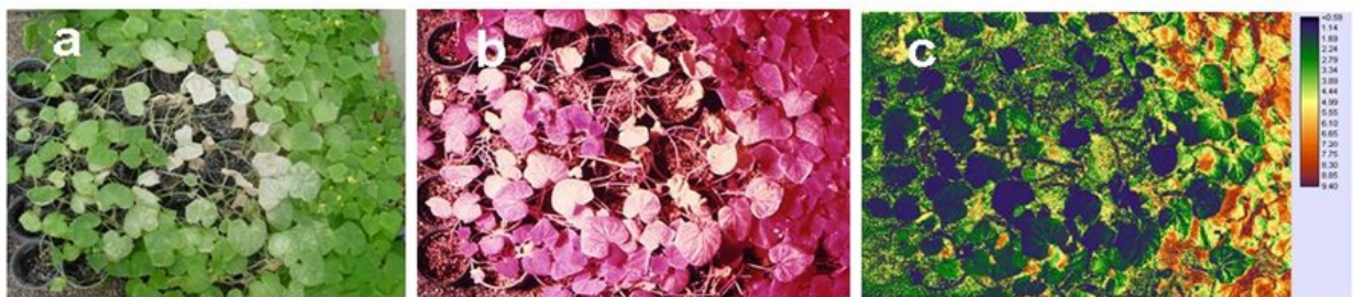
Fig. 5. Extensive mite feeding damage within the central portion of the planting was evident in CC imagery acquired on 10 October 2005 (a). A much greater extent of damage was evident in CIR imagery (b) and ratio imagery (c), both of which indicated extensive damage throughout the planting.