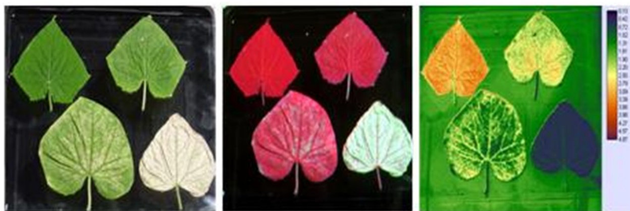
Fig. 1. Foliage of cucumber ( Cucumis sativus ) exhibiting various levels of foliar damage caused by spider mites ( Tetranychus spp.), photographed in conventional color (left), color infrared (middle), and transformed to simple ratios of near-infrared to red reflectance (right). Damage levels within each frame ranged from zero (upper left), to slight damage (upper right), to moderate damage (lower left) to heavy damage (lower right). (Modified from

decreased progressively as mite damage increased ( F=17.2 ; df=2,9 ; P<0.001 ; Table 2), and imagery based on the simple ratio (SR) clearly indicated relatively high NIR/R ratios among plants exhibiting 'light' damage and relatively low ratios among counterparts exhibiting 'heavy' damage (Fig. 2).