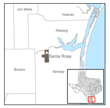
Fig. 1. The location of study site (East Foundation's Santa Rosa Ranch, Kenedy Co., near Riviera, TX)

glandulosa Torr.) and huisache (Acacia farnesiana (L.) Willd.) savannah, and oak woodlands (Quercus virginiana Mill.).