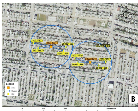
(Fig. 2) Example of the distribution of clusters (outlined by black circles) and neighborhood in (A) McAllen and (B) Reynosa. Orange squares represent the location of AGO traps. Yellow circles represent the location of ovtrops. Blue arrows serve as reference for the visual representation of distance among traps. Figure elaborated in ArcGIS Desktop 10.0 by the Medical Geography Area of the National Institute of Public Health.

Entomologists from CDC’s Dengue Branch, Division of Vector-Borne Diseases, donated the AGOs and